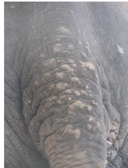
Figures 3a and b: Skin related problems observed elephants associated with mutts